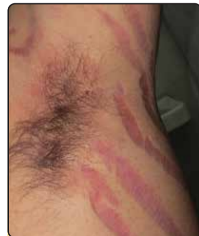
TCS induced striae