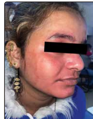
TCS 'damaged' face